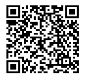
Learn more at tecan.com/magicprep-ngs

The MagicPrep NGS system and kits provide everything you need for library preparation. Simple, intuitive consumables, workflow and software virtually eliminate the requirement for training and possibility of errors. The simple 10-minute run setup and fully automated library preparation provides reproducible libraries and more time for other experiments increasing lab productivity.