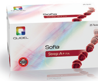
Strep A+ FIA