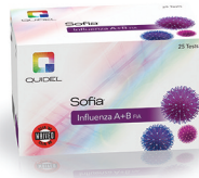
Influenza A+B FIA