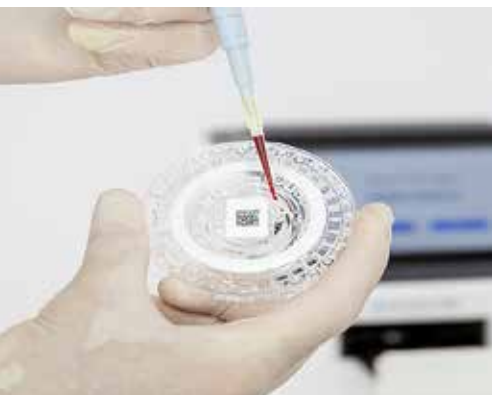
1 Pipette sample