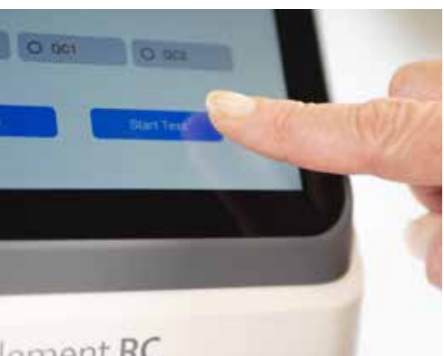
3 Start measurement