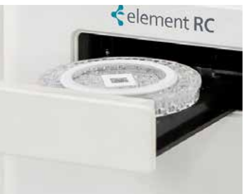
2 Insert rotor